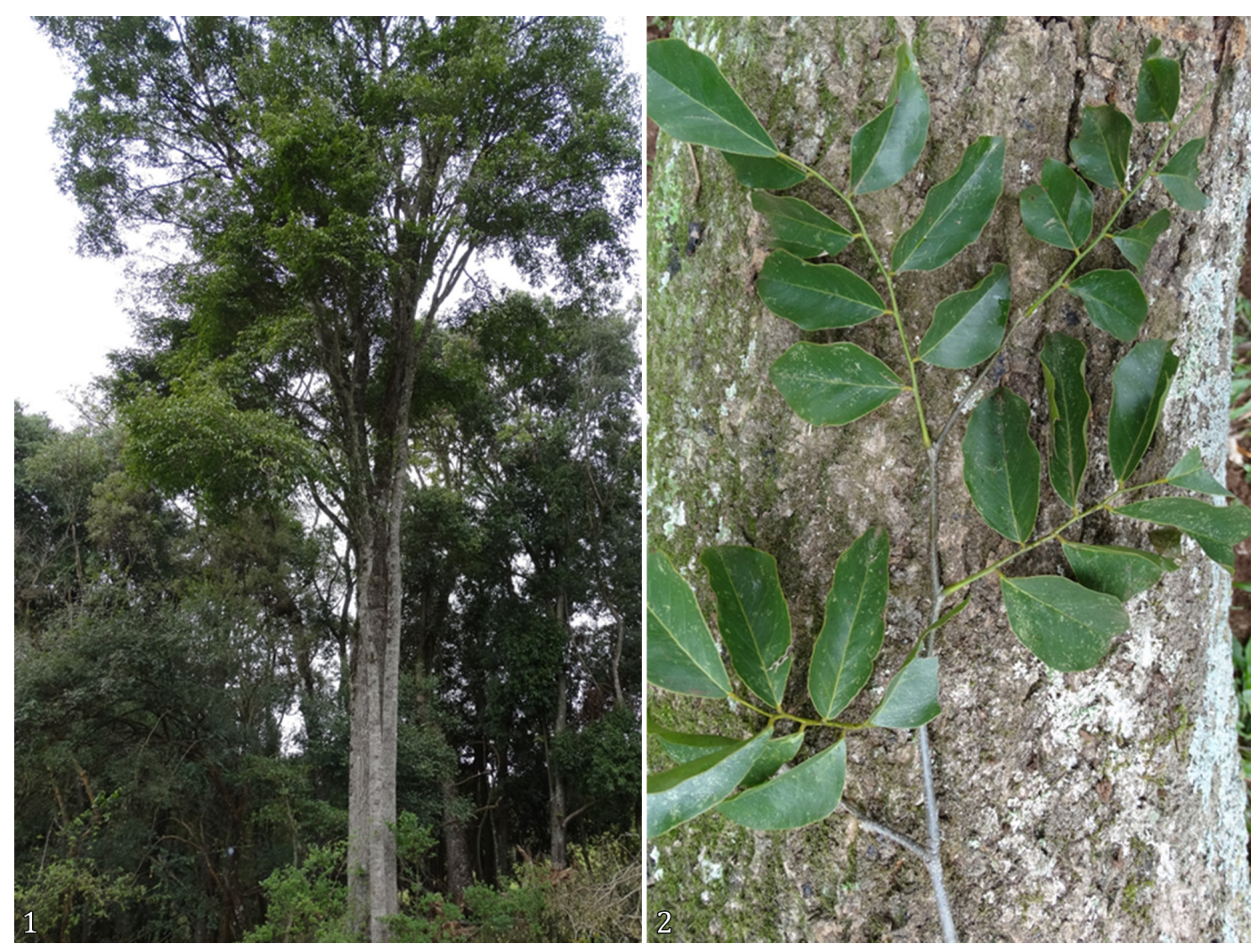
Fig.1-2. Myrocarpus frondosus.

On this property, four Holstein heifers and one Jersey heifer consumed leaves of this plant, and all of them became ill, with clinical manifestations. The paddock consisted of native pasture. and the heifers were supplemented with corn silage. No other plants were known to be toxic in the access paddock of heifers that fell ill. On the 1st day after ingestion of the plant, the heifers showed decreased appetite (5/5). On the 2nd day, they were found in the water, had inappetence and marked apathy (5/5). On the 3rd day, the previous signs persisted, in addition to decreased ruminal and bowel movements (5/5), abdominal breathing (5/5), and dry stools (2/5). On the 4th day, the sclera and conjunctiva were congested and jaundiced (2/5), with a jaundiced and dry snout (1/5). On the 5th day, all animals presented polydipsia, and one heifer presented behavior of walking in circles, incoordination, and restlessness, progressing to death. On the 6th day, dry stools (2/4) were observed, along with concentrated urine (2/4), jaundiced mucous membranes (3/4), and restlessness when exposed to the sun (4/4). From the 7th day on, three heifers showed improvement, and one remained apathetic, with jaundiced mucous membranes, ulcerations with scaling, increased respiratory rate, and fever, progressing to death 18 days after ingesting the leaves of the plant.