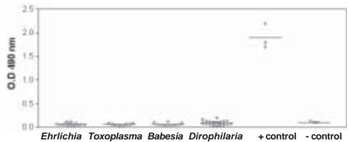
Fig. 2. Absence of serum reactivity between sera of infected dogs from non endemic areas with other confirmed infectious disease and total antigen from Leishmania chagasi in ELISA assay detected by protein A peroxidase conjugate. The mean of samples is indicated.

Several antigens have been used to diagnose visceral leishmaniasis (Rhalem et al. 1999). In general, the purification of these antigens requires equipments and long time for preparation. In this study we used whole antigen in ELISA in both systems. The ELISA test using whole antigen parasite for the diagnosis of canine leishmaniasis has advantages over other methods currently used. The antigen prepared from total